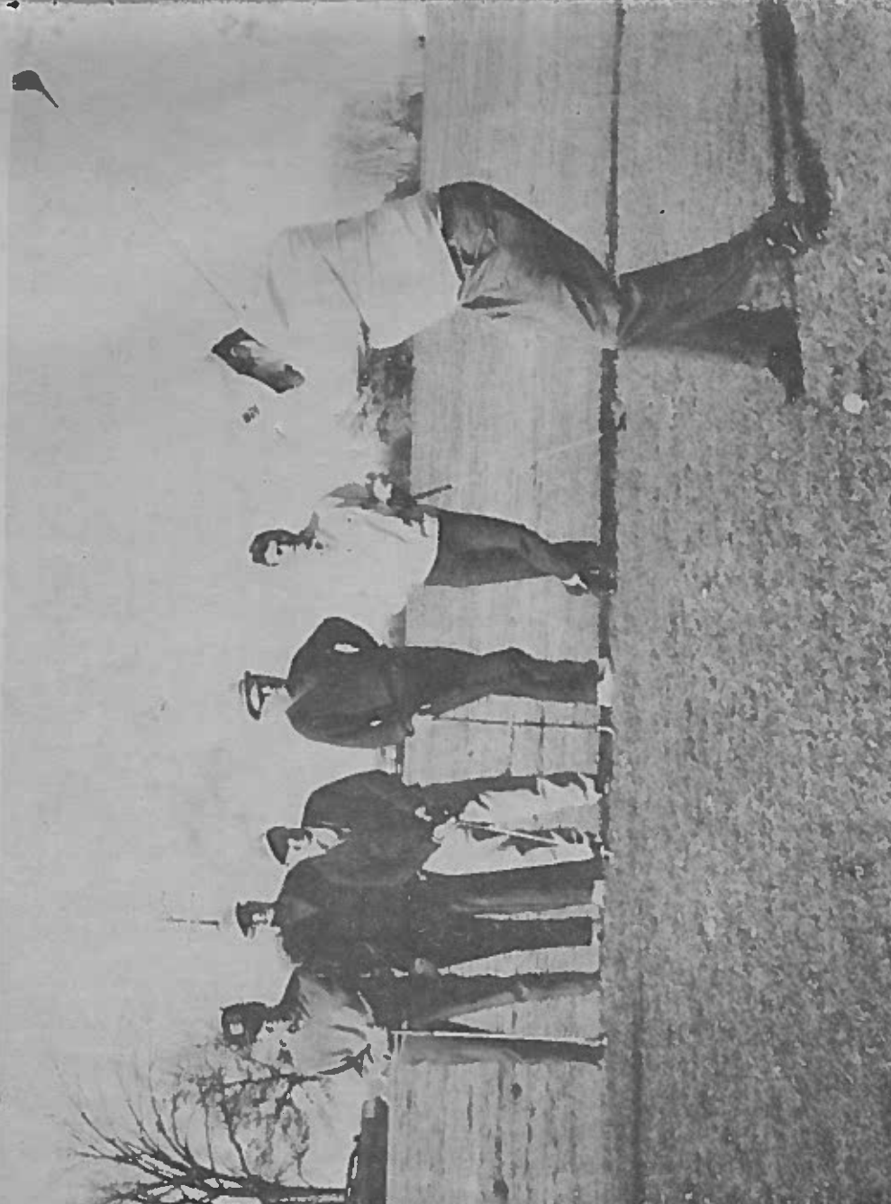
Takes a Swing

Throughout the building of the course, one small section of land remained the same as it had for many years. A small family cemetery, once lost among the weeds, is now neatly kept between the No. 18 and 11 fairway — a reminder of the past.